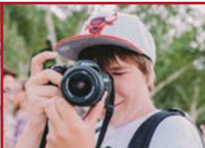
Spanish and photography program