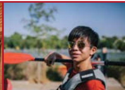
Spanish and sports program