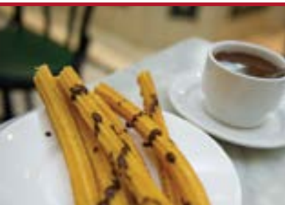
Gastronomy and enology program