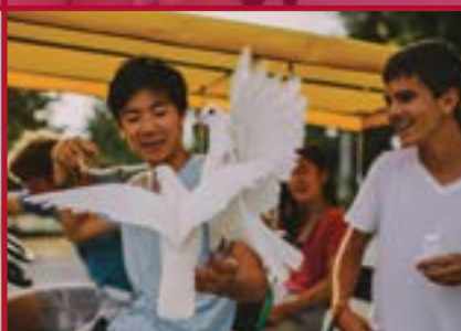
Cultural visits program