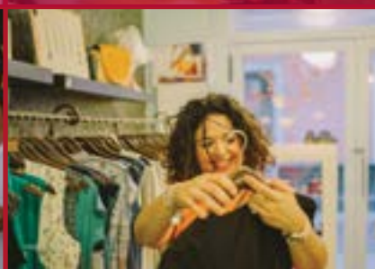
Spanish and shopping program