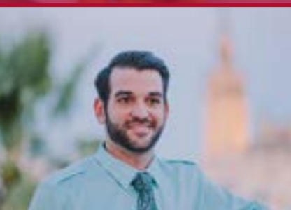
Spanish and business program